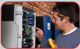
AC / DC Drives / Inverters

Below are some examples of services we offer here at CAMIS ELECTRONICS , giving you a quality repair service with a quick turnaround time.