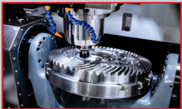
CNC Machine Tool Controllers