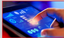
Touch Screen LED's / LCD's