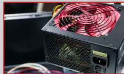
PSU's / UPS Systems