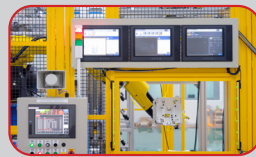
HMI's / Monitors